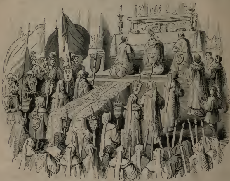
Placing the body before the Altar.